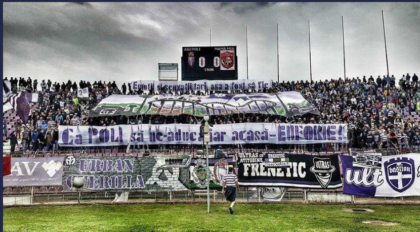
UPT Teams at sport events