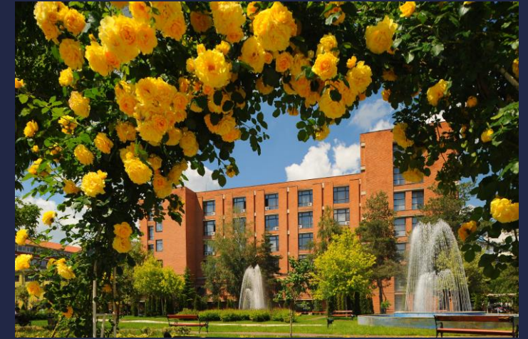
Parks on campus